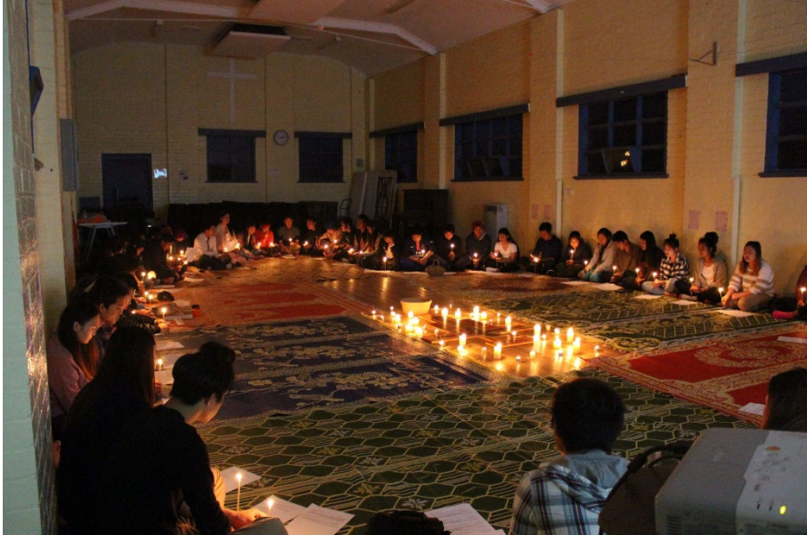
Karen Anglican Youth Werribee - Sung Prayer around the Cross (Taize style) 2015